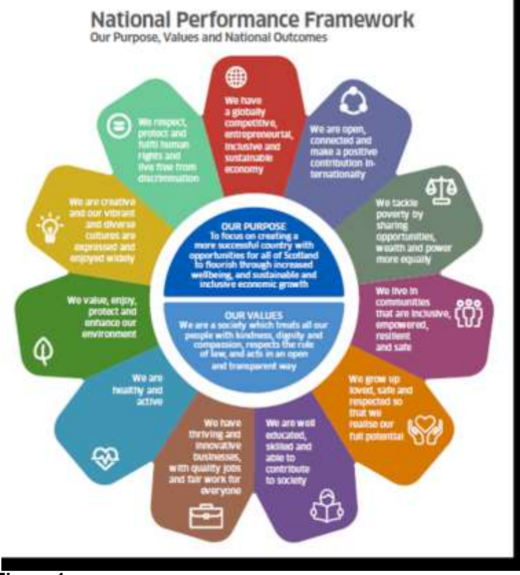
• act in an open and transparent way.

To help achieve the Government's Purpose, the Framework sets out National Outcomes. These outcomes describe the kind of Scotland it aims to create.