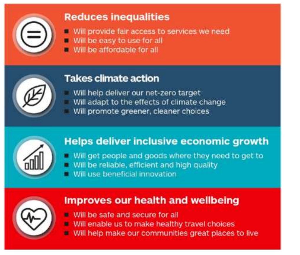
Figure 3 The National Transport Strategy Vision – Interconnected Priorities National Transport Strategy: Priorities and Outcomes.

That Vision is underpinned by four interconnected Priorities, each with three associated Outcomes (see Figure 3).